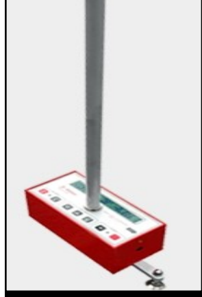
WALKING FLOOR PROFILER

We have been getting F<sub>F</sub>25±5 with a hard float finish (fuzzy finish) ...hitting the concrete only once with a power trowel.